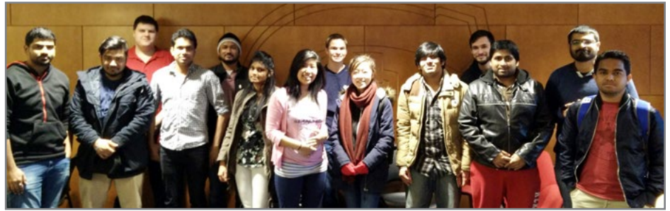
@ Information Assurance (IA) Club members at the General Meeting.

The Information Assurance (IA) Club at SCSU is a student-run organization for students in Information Assurance, Information Systems, and other IT and cyber security focused programs. The club was formed to allow like-minded students to interact with one another outside of class and to expand their knowledge in cyber security and IT field.