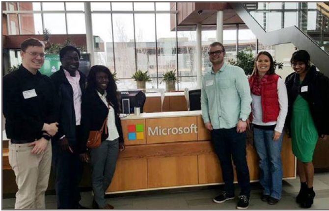
@ NSF (CESP) Scholars at Microsoft office on their Spring 2016 field trip.