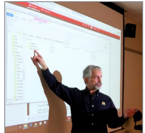
@ SAP training at Centennial Hall computer lab.